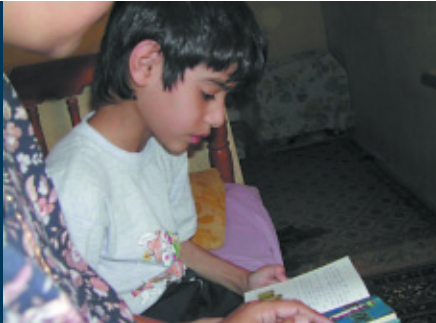
A Rep reads with one of the children.