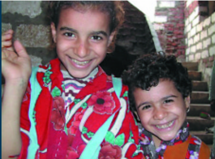
The smile of a grateful child: priceless reward for doing God's work

Wow, you really keep a great tracking of costs. I am happy to see that my donations are well accounted for. You just never know these days with all the charities out there, and where they are really spending our money. I see our donations, interests, and the Coptic orphans are in very good hands. Keep up the great work!