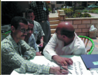
Coptic Orphans Reps working together at our Rep Conference, which is held every two years.