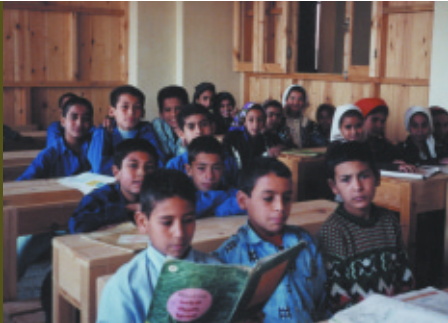
A typically segregated Egyptian classroom.