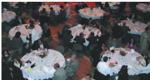
Over 200 Coptic Orphans supporters attended our gala at the Austrian Embassy in Washington, DC on October 11, 2002. The gala included a silent auction and opportunities to sponsor children. Together, we raised over $20,000 and increased awareness of the children and their plight.

The year 2002 was a year of collaboration for Coptic Orphans. All over the world, we have been working together for the children of Egypt. Coptic Orphans opened two new branches—one in Australia and one in Canada—in addition to our Washington, DC headquarters. In Egypt, we gathered over 130 Reps for our conference, held every two years, and brought three volunteers from Detroit, Michigan, to Upper Egypt for the Serve to Learn program. Our first annual Coptic Orphans Gala in Washington, DC brought together over 200 supporters of our cause. Rutgers-Newark's Coptic Society in New Jersey gathered over 50 people for another fundraising dinner on behalf of Coptic Orphans. Twenty aspiring athletes gathered around Lake Accotink, Virginia, for our second annual 5K run. In Australia, Coptic Orphans has been featured on three radio shows and a television show. Australia's volunteers have been setting up a Coptic Orphans stall and selling Egyptian papyrus at local markets to benefit the children. Individuals everywhere are spreading the word about our service for God's children.