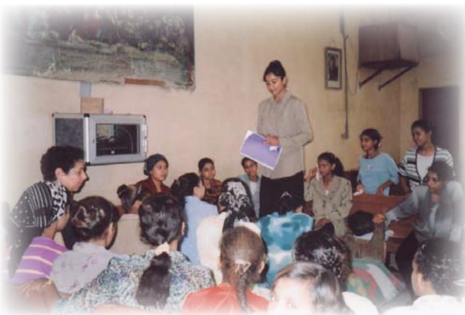
Some children who graduated from Coptic Orphans programs now serve as National Literacy Teachers in their areas.