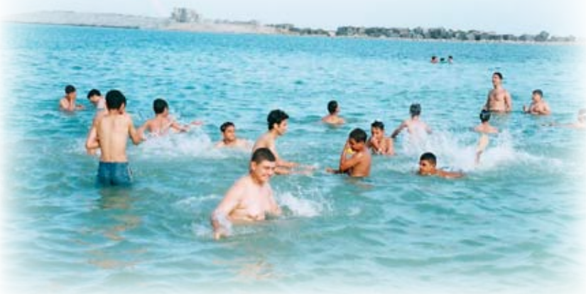
The boys enjoy the cool waters on a hot summer day.

The US Embassy in Cairo awarded the Valuable Girl Project with $50,000 to further its work in Egypt for girl education. This additional funding enabled Coptic Orphans to carry out in-depth trainings of the local coordinators, purchase books, educational materials, and arts and crafts materials to enrich the educational experiences of the girls and broaden their outlook and also to upgrade the facilities of our program partners.