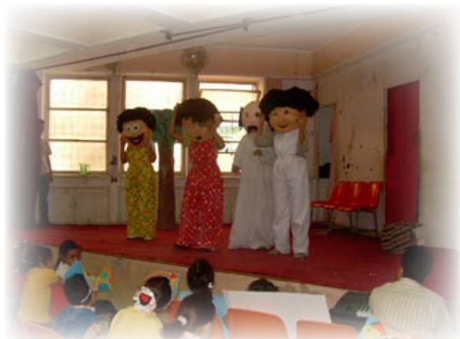
Children attending a workshop are given a performance by some special characters.

Great strides were made this year to ensure the continued growth of the organization's programs and reach. Reps at the fourth bi-annual Rep Conference democratically selected a new name for the Child Assistance program to better express its goals and activities. The new name Not