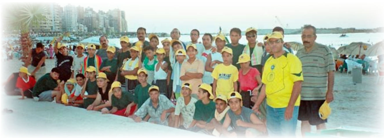
Children learn leadership skills with the YMCA in Alexandria

Coptic Orphans was awarded third place in the GlobalGiving Olympics resulting in a permanent feature on GlobalGiving's website and a monetary award amounting to over $16,000. The Catalogue for Philanthropy selected Coptic Orphans to be featured in its international section deeming it as an "excellent, trustworthy non profit ... certainly among the best smaller charities in Washington."